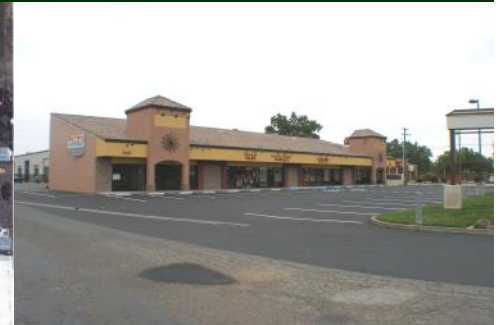
Available shop space